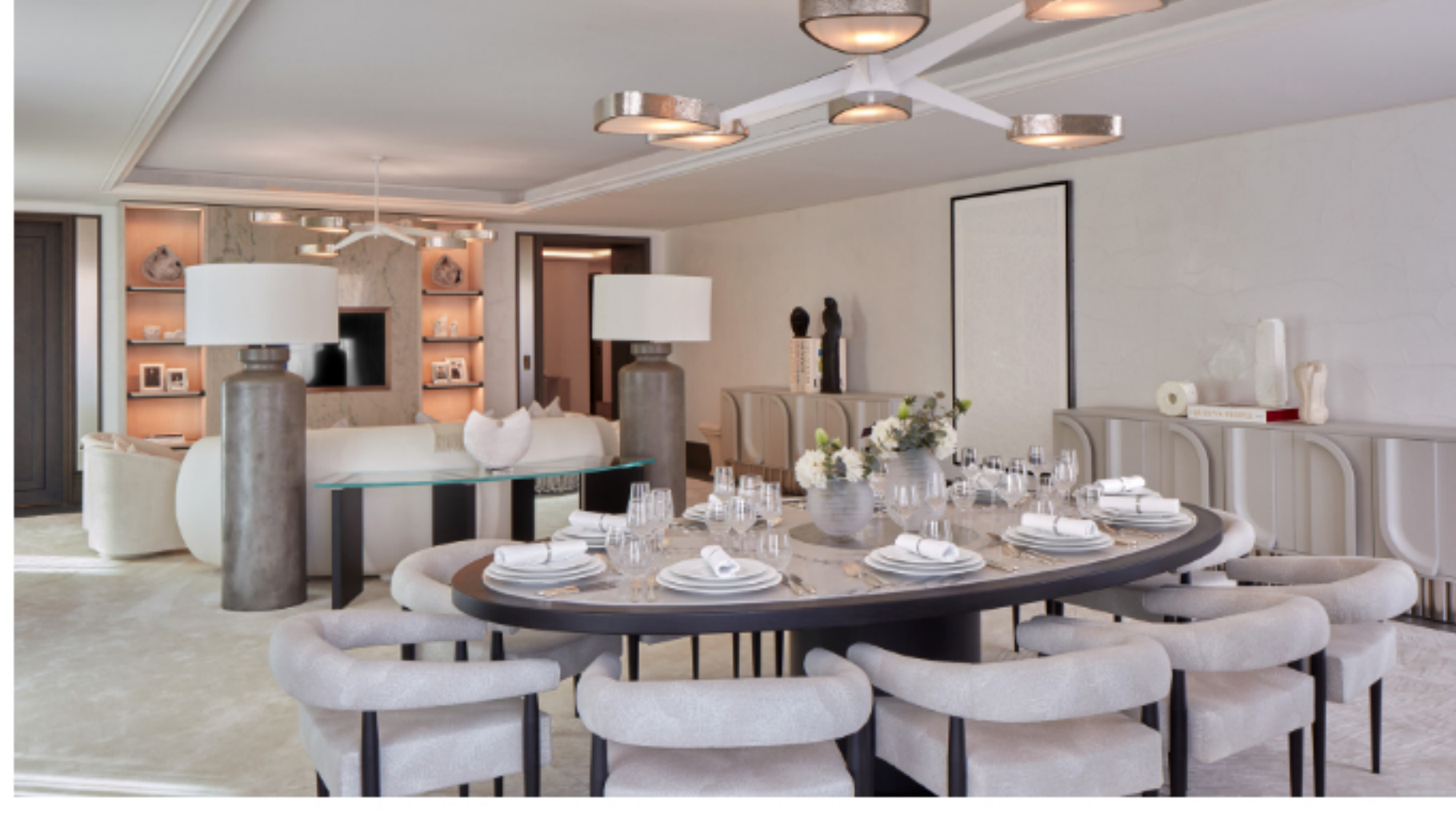
A living space at Clarges Mayfair, Interiors by Martin Kemp Design

Paying homage to the prestigious locality, the exterior of the building has been designed by award-winning architecture firm Squire & Partners, while the contemporary interiors are the work of London-based Martin Kemp Design. Designed by light sculpture specialists, Haberdashery, the grand entrance hall creates a breathtaking first impression and features a quadruple height domed ceiling.