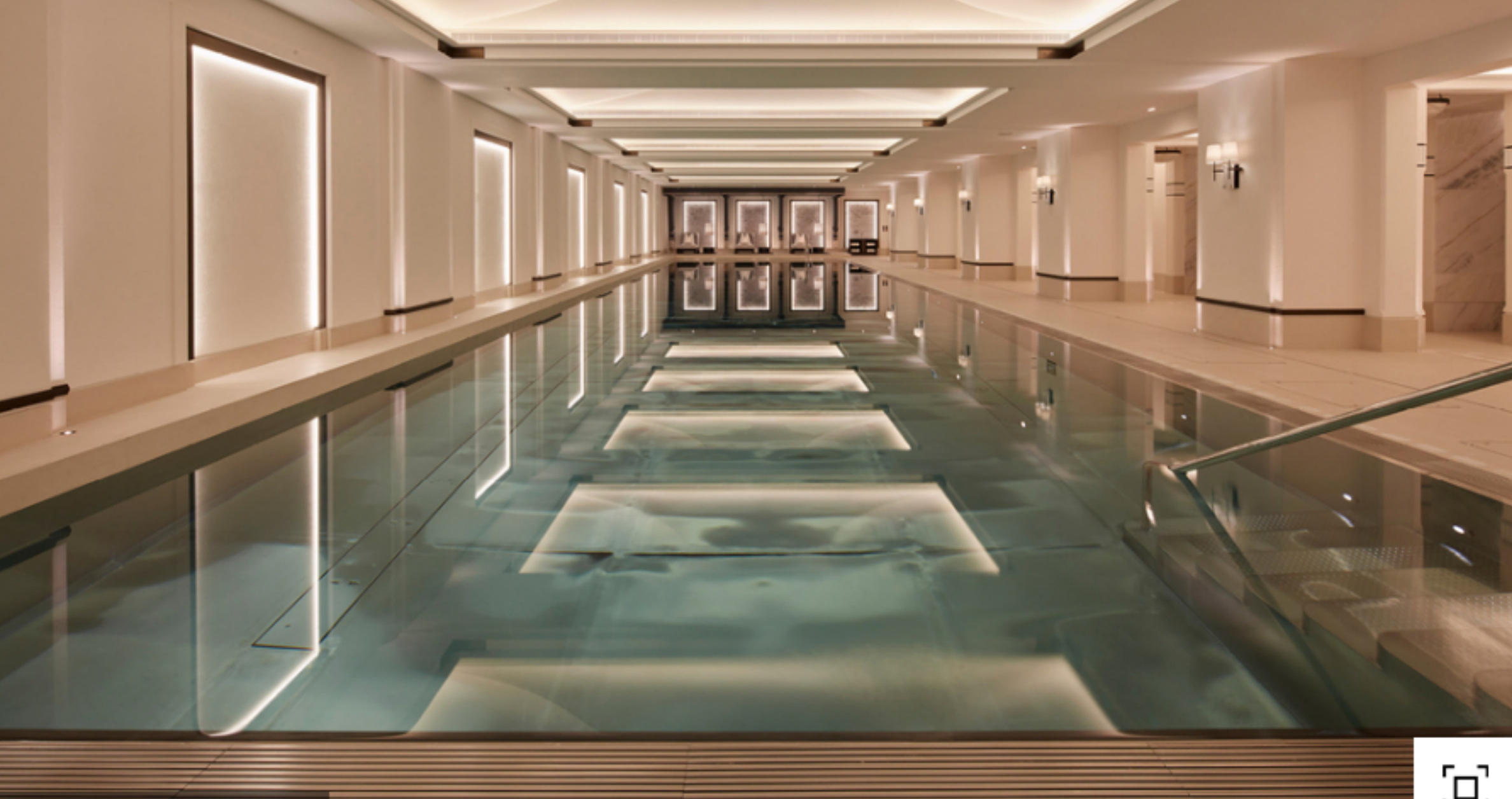
The indoor pool at Clarges Mayfair