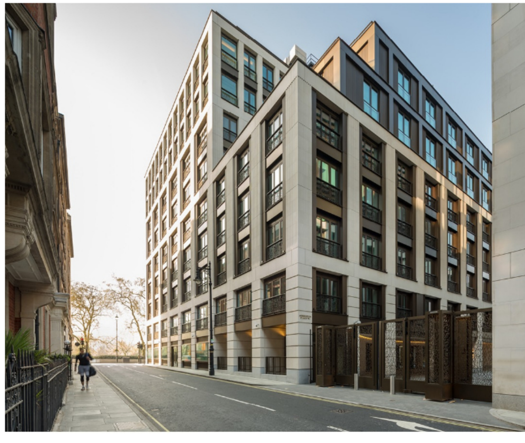
The exterior of Clarges Mayfair in London, designed by Squire & Partners

A nod to the neighbourhood's history, the sweeping staircase features exquisite metal detailing that is reminiscent of luxury watch craftsmanship. The attention to detail throughout Clarges Mayfair extends through the communal areas and into each of the apartments.