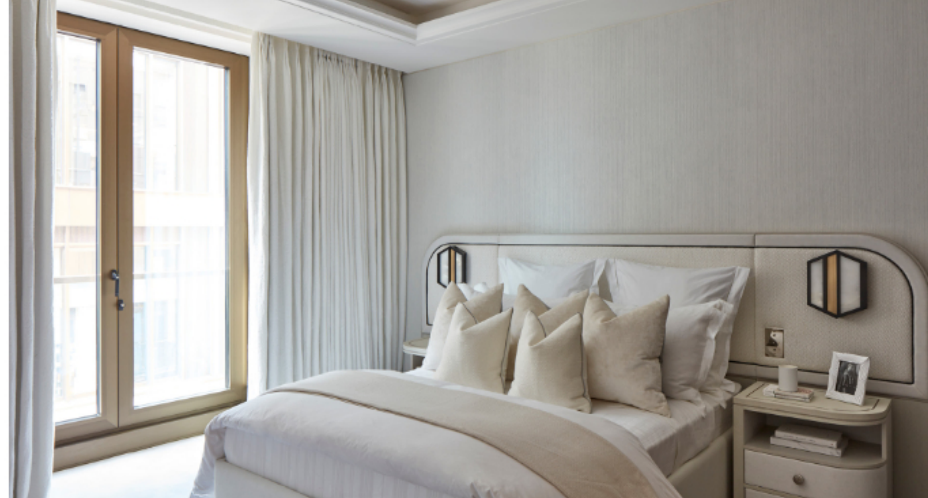
A view of the bedroom designed by Martin Kemp Design

Materials include black onyx and Nettuno marbles, as well as Tanganika timber and dark stained oak. Rich, luxurious fabrics feature alongside nickel polished ironmongery and Art Deco-inspired doors, with embossed metal detailing reflective of the local street network of Mayfair.